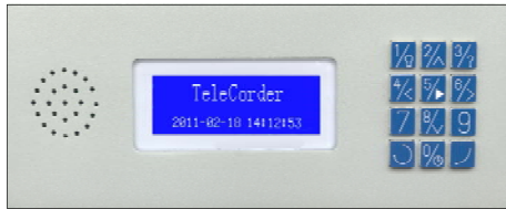
Front with speaker, LCD display, & keypad

Models TCwL-2F & TCwL-4F 2 or 4 channels with built-in player and HDD