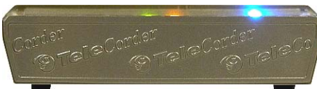
Front with power & channel activity lights

Models UC-02B & UC-04B 2 or 4 channels record hard drive on PC